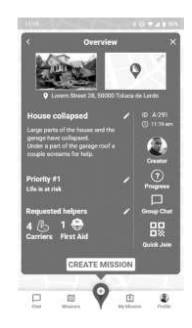
Figure 4 UC5 Design of Mission Creation

UC6: Processing and completing a call for help.