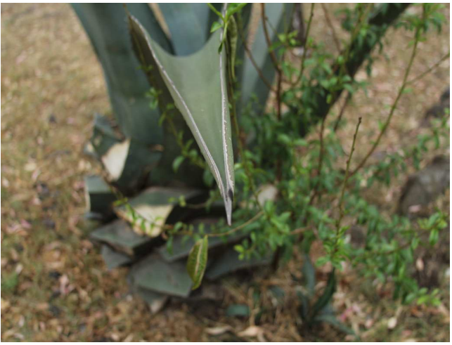
Fig. 2 Common Maguey, there are approximately 273 families so far discovered. It is located throughout northern, central and southern America. In Mexico, there are 205 species which 151 are endemic. Photography: Arturo Santamaria Ortega, 2013, Coatepec Hill, Toluca, Mexico.

Meanwhile, the maguey has different uses, one of them is to get alcohol later processed in different ways, the most well-known being tequila, and also the fibers are used for textiles.