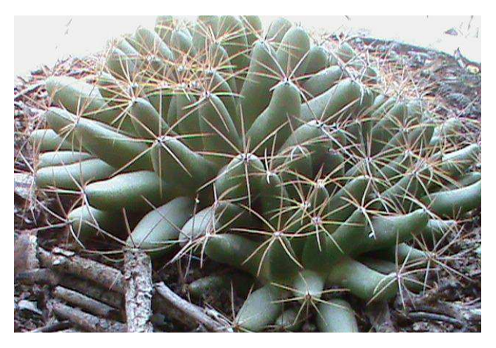
Fig. 3 The Barrel is a cactus that has several interesting natural systems including holding water, but also capturing it. In a rainy day, it can store up to three times its volume, thanks to the shape of its spines. Photography: Arturo Santamaria Ortega, 2013, Zamorano Hill, Querétaro, México.

Finally, the Barrel is a cactus that has several interesting natural systems including collecting and storing water. In a rainy day, it can store up to three times its volume, due to the shape of its spines (see fig. 4). These water systems are similar to the polar bears hair's temperature mechanism, which allow them to preserve healthy heat to develop and live. This is another use of Biomimicry that will be the subject of the next steps of the project.