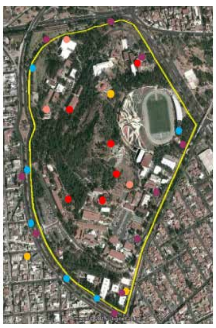
Figure 2.Risks in the University Campus and his adjacent environment. Autonomous University of the State of Mexico.2015.

Source: Image obtained of Google Earth's platform. On June 8, 2015.