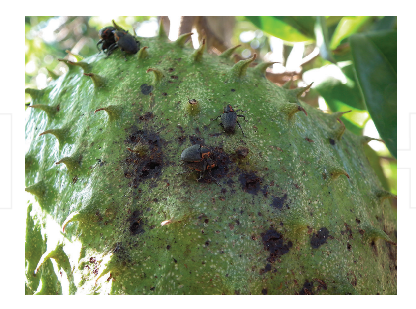
Figure 7. Damaged fruits of soursop by Optatus palmaris.

Optatus palmaris causes damage in chirimoya (Annona cherimola) [41, 42]; it has also been found in soursop, Annona muricata L. and ilama (Annona diversifolia L.). The larvae feed on the pulp and seeds of the fruit; in the final of the larval stage, it leaves the fruit and pupae in the soil [42]. Adults make holes in the fruits of soursop and chirimoya when they are feeding (Figure 7) or lay eggs (Figure 8); when there are no developed fruits, they feed on the petals and pedicel of small fruit, causing its fall. Damage of the species of the genus Optatus in A. cherimola corresponds to a pattern of drawings, similar to the letters "C" or "O," which is a group of holes caused by adults when they feed; in places where the larvae feed, first necroses and slight watery discharge are observed; feeding causes a small hole deepens to seed; when moves from the fruit, it leaves a hole of 2-3 mm in diameter [42]. In soursop, O. palmaris adults can damage 38% of the total area of the fruit and it is possible to find an average of six larvae per fruit. The fruits most affected are those close to the harvest [34].