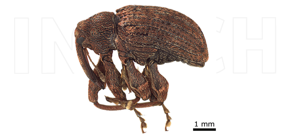
Figure 3. Conotrachelus perseae, small avocado seed weevil.

sides. The mesothorax has two pairs of setae located within a lobe and in the middle part is the other rounded lobe. Abdominal segments are characterized by two pairs of setae in the ventral part of each segment; the eighth and ninth segments present a pair of lateral setae [12]. Adults ( Figure 3 ) are dark brown; prothorax, in dorsal view, is strongly constrained in the apical portion [3, 13–15]. Humeral region of the elytra of C. perseae is wider than the base of prothorax.