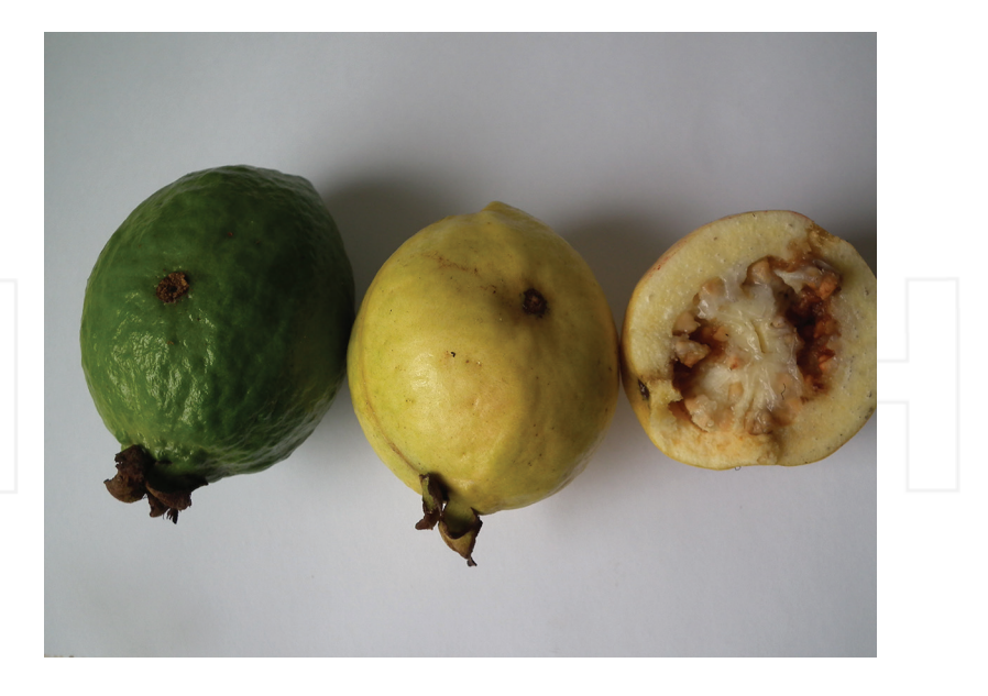
Figure 5. Damaged fruits by Conotrachelus dimidiatus.