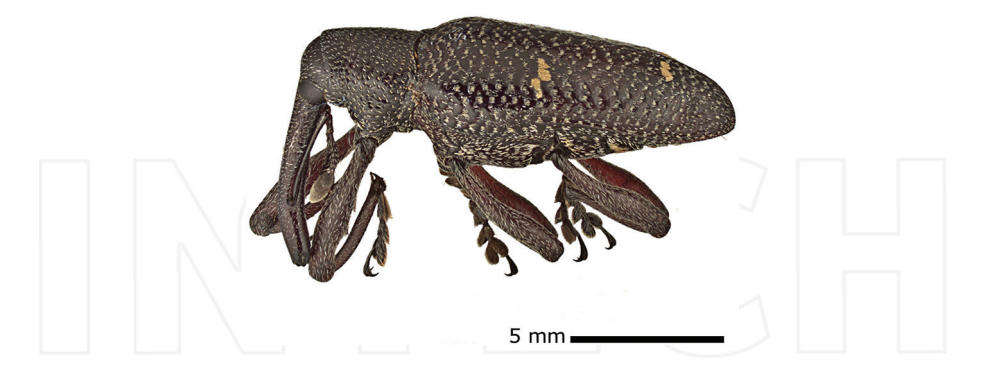
Figure 1. Male of Heilipus lauri, big seed borer of avocado.

irregular enlarged spots, formed by copactation of small opaque orange oval scales. The first pair is the biggest and it is located 2/5 at the base of the elytra and the second one, 1/5 of the apice, located almost over the periapical callus [4].