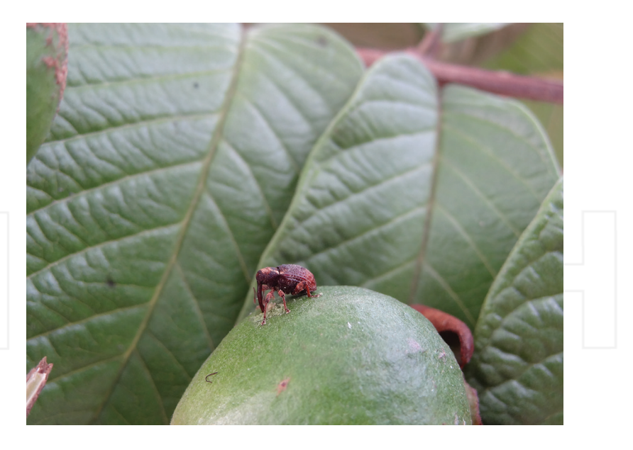
Figure 4. Damages in fruits by adults of Conotrachelus dimidiatus.