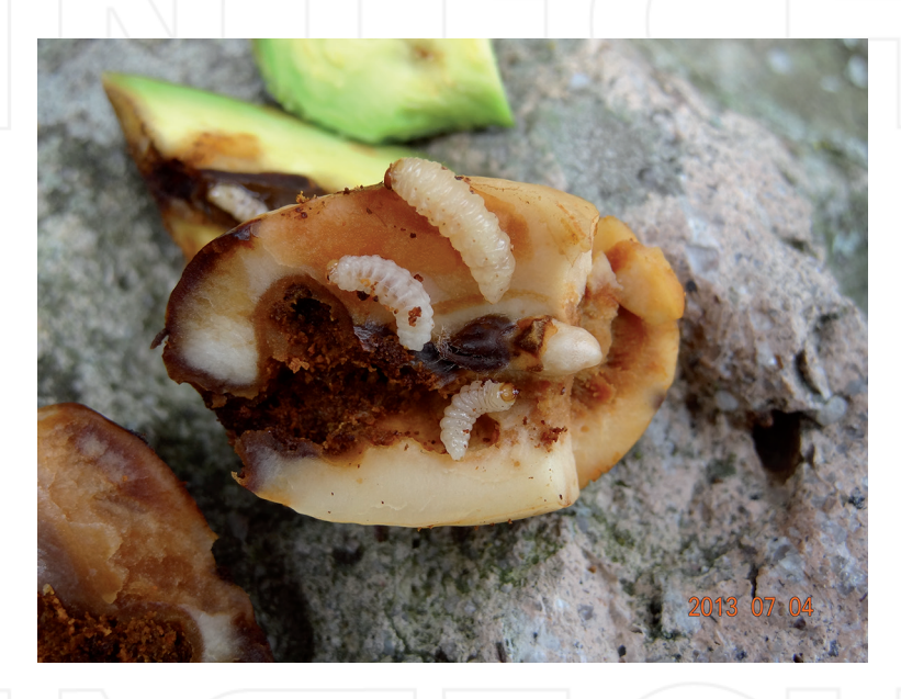
Figure 2. Damages in fruits by Heilipus lauri, big seed borer avocado.

Females drill and lay eggs directly in growing fruits ( Figure 2 ) causing its injury inside; once the larvae emerge, they feed through the pulp to reach the seed where it completes its life cycle. When heavy infestations are recorded and no management is used, infestations of larvae can damage up to 67% of the fruits; in orchards with management of the pest, it has been quantified losses of 3% [9].