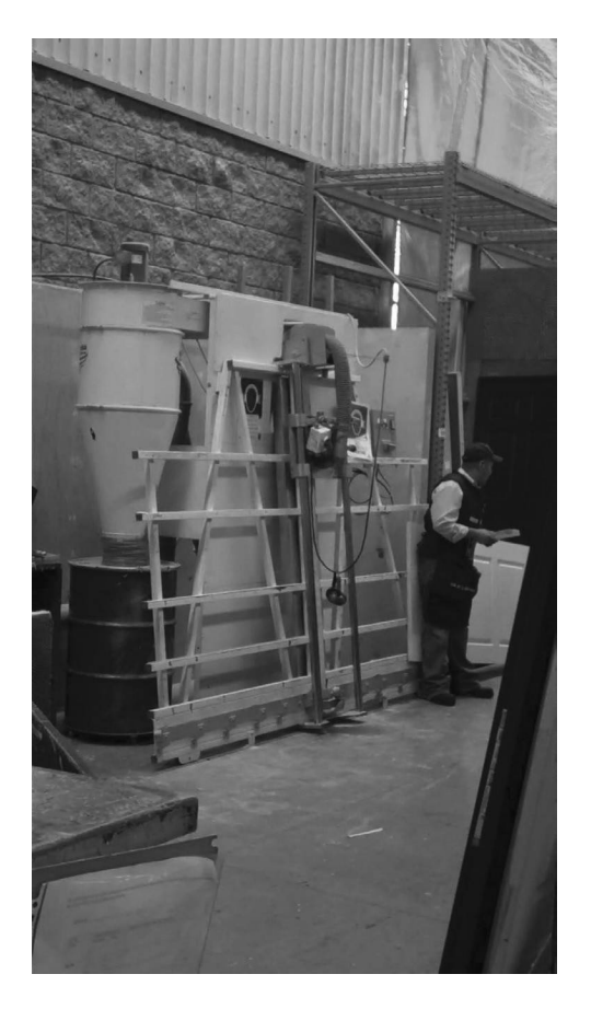
FIGURE 12.3 (See color insert.)

A vortex creates an ascendant flow to suspend the particles imitating wind. Then the suspended particles are trapped in the drops imitating rain, and absorbed in a filter that imitates deposition and soil filtration.